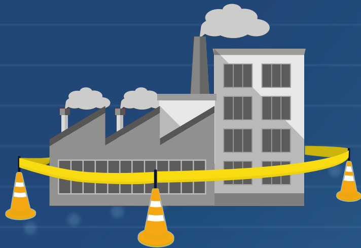
Average number of unplanned downtime incidents

Industrial automation operations continue to risk failover, data loss, lost wages and customer dissatisfaction.